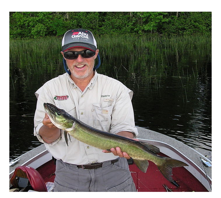
Duffy's quote "You don't always have to catch big ones to have fun."