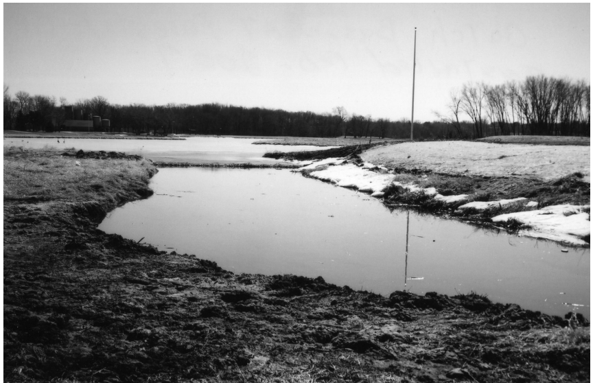
Catch Basin at Forrester Drive, installed Feb. 2007.