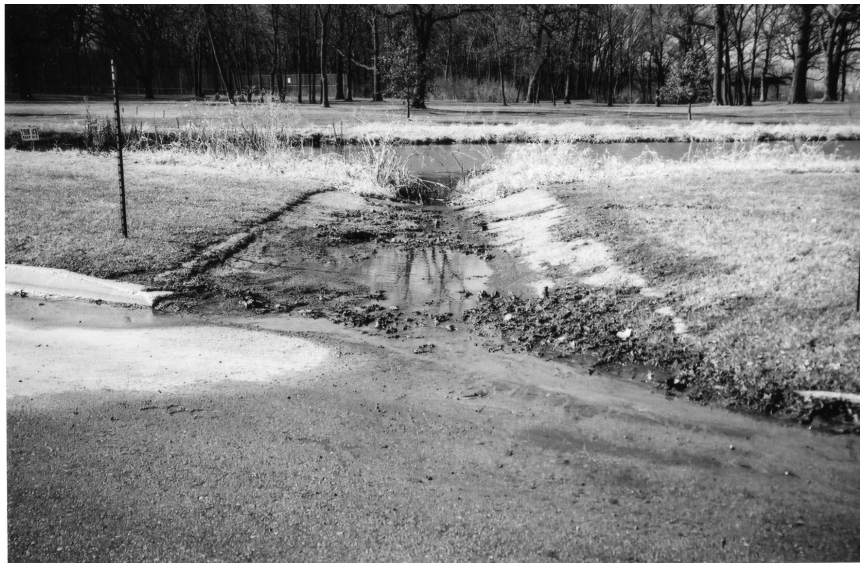
Warner Lagoon, March 20, 2007, close to the shelter, from the parking lot.

Last year 66,000 pounds of sand were dredged out. Most of this results from street runoff.