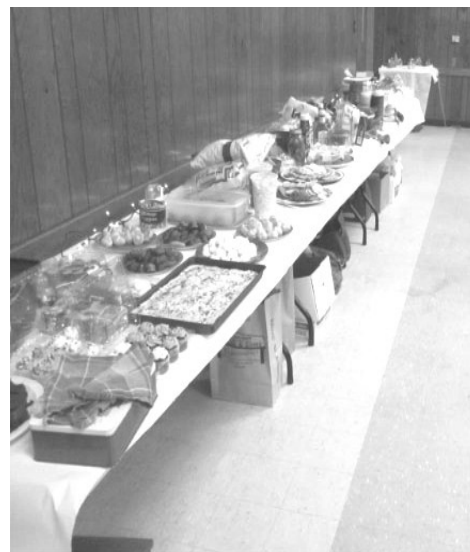
And lots of great Food!