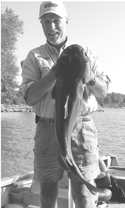
Duffy loves these 16 inch late-season Cats