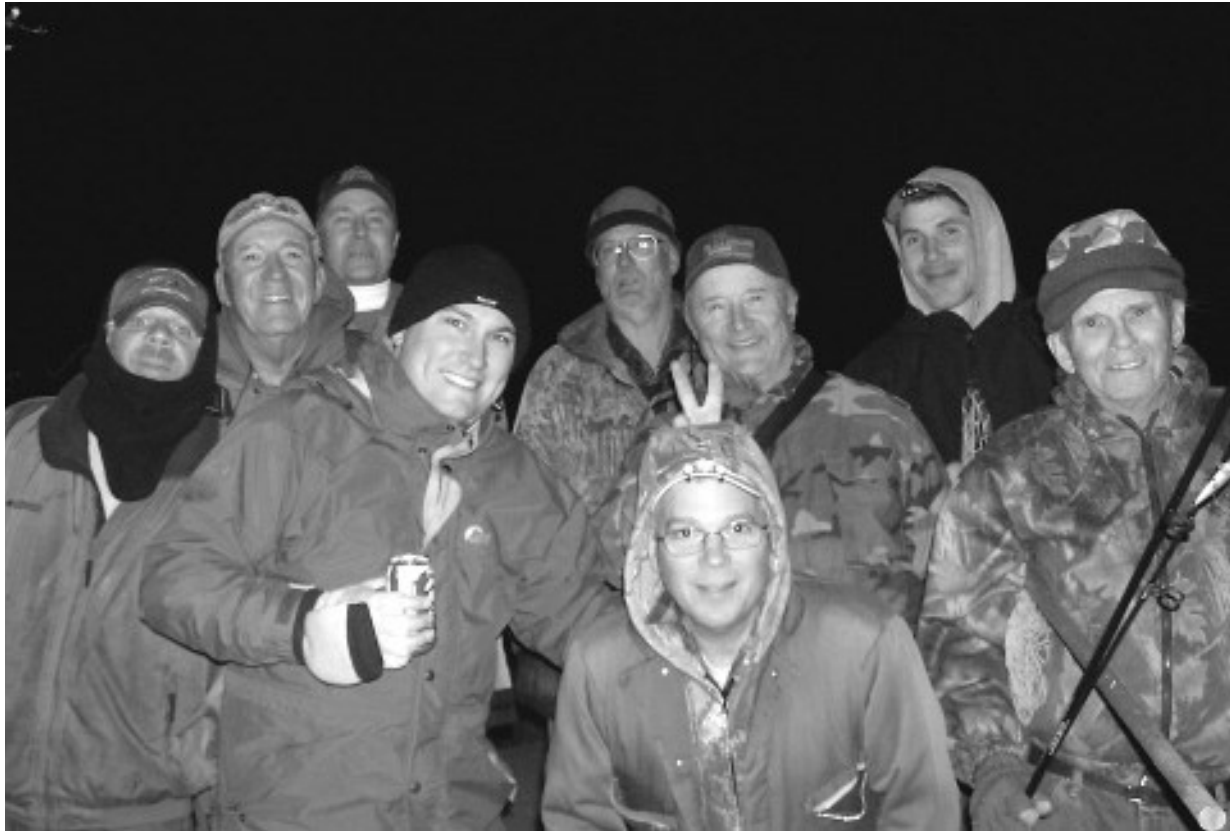
Not many fish were caught, but the weather and company was great.