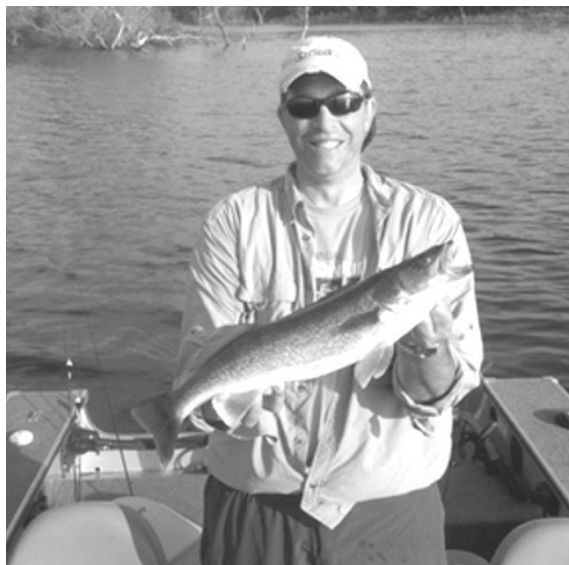
Figure 3 one of the nicer slip bobber fish

Slip Bobbering – I covered this in May at the meeting. Basically we would find flooded timber usually a shoreline or fence line in about 5-15' of water and if it had an inside turn from a point or under water feature to funnel the fish up into the trees we would find fish. This year we seemed to have to go up in the size of hook to a number 4 from our usual 6 when using leeches on the bobbers. We caught hundreds of walleye around 12' and they seemed to be really adept at avoiding the hook until we went to the number 4 octopus style hooks.