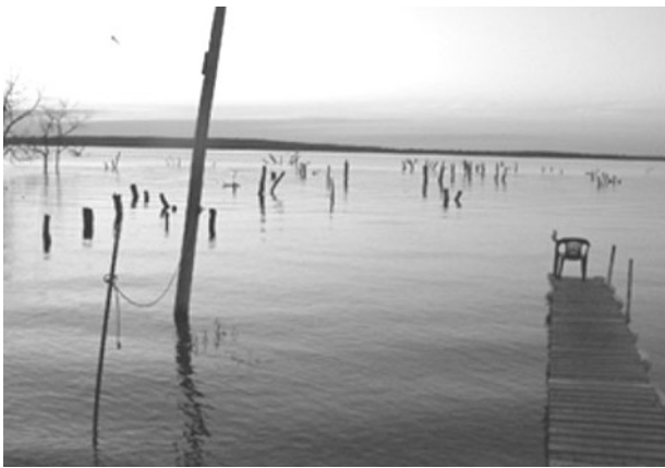
Figure 1 - Devils Lake last year

What struck me right away was how much the lake had changed. Our old honey holes were at least 5 feet deeper according to my locator. Even though we were a little over a week later than our usual timeframe for the trip the water was still very cool and clear and typically the fishing was good until about 10 and then really slow from 1-4 PM and got crazy from about 6:30- 9:30 or 10 PM when we headed in to avoid putting the lights on the boat.