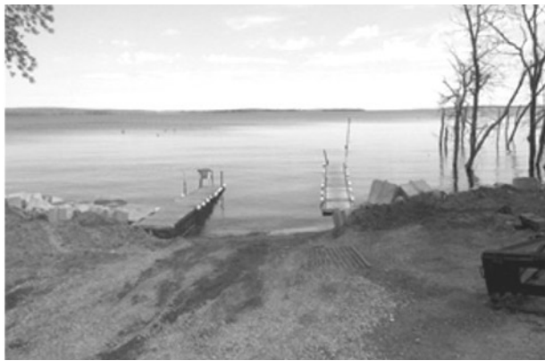
Figure 2 - Devils Lake this year, same dock area. All the cut off stumps in picture above are under water.